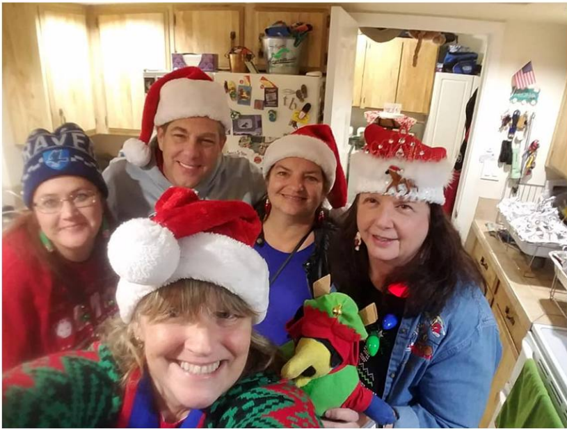
Last man standing photo at the AZPHC Christmas Party