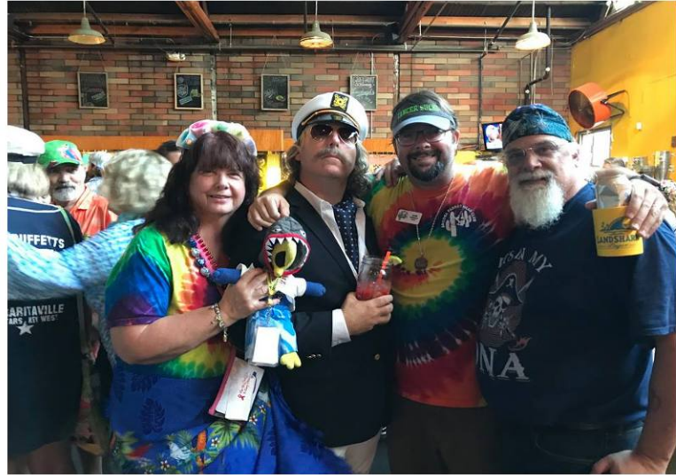
Pre Buffett Concert