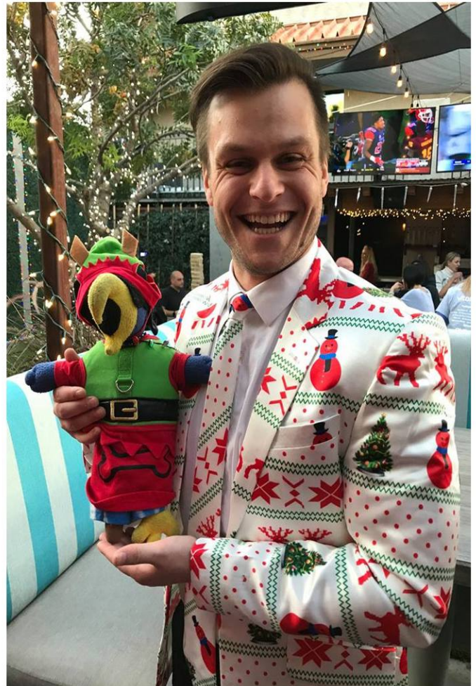
12 Bars of Charity Pub Crawl