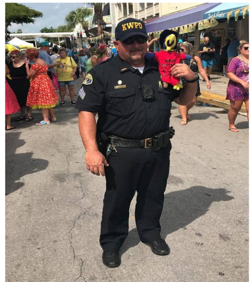
Hanging with the local PD

If you want me to travel with you-please contact the Queen at baumanpartypalace@yahoo.com