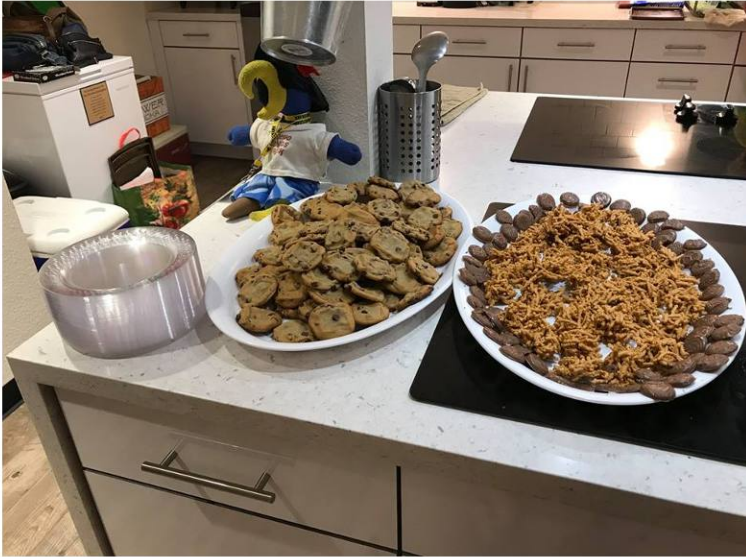
Helping out with the Ronald McDonald Meal