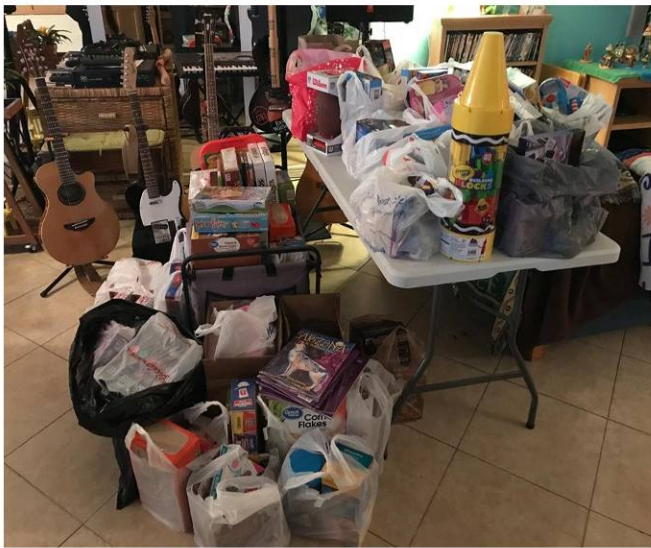
Collected lots for Ronald McDonald House!

Wow! We do know how to Party with a Purpose! I will tell the story through pictures. As always great food, great people and a couple charities benefited! We collected a lot for Ronald McDonald House and our 50/50 netted $245 towards our 4th Quarter Charity: Gigi's Playhouse. Parrot Heads are the best!