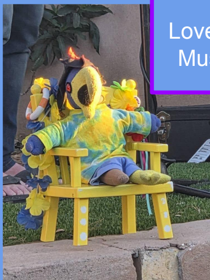
Love Live Music!!!