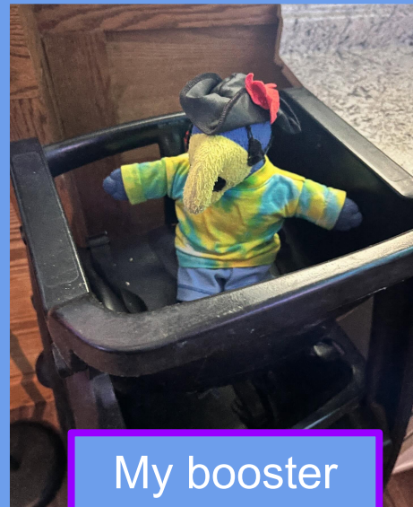
My booster seat!!!