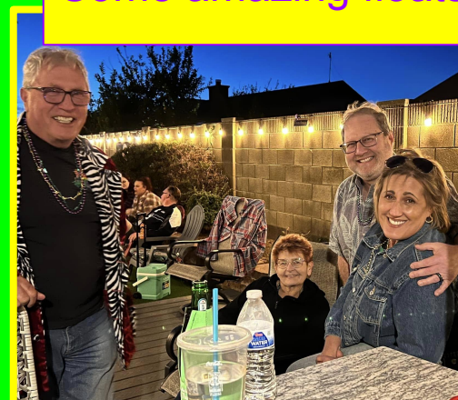
Mardi Gras King and Queen!!!